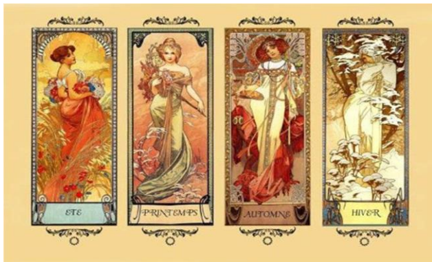
Four Seasons: Winter-Spring-Summer-Fall

Which should you buy? My advice is always choose the better stamp because it will add value to your collection and the cheap stamp won't; think quality, not quantity. It may pay off for you someday as it did with me. # You can send any comments to stampguy@hotmail.com .